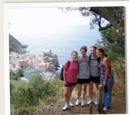
HIKING IN CINQUE TERRE

studying abroad. Support and encouragement from parents can make all the difference in how a student goes about the process and how well-prepared s/he is to undertake a study abroad.