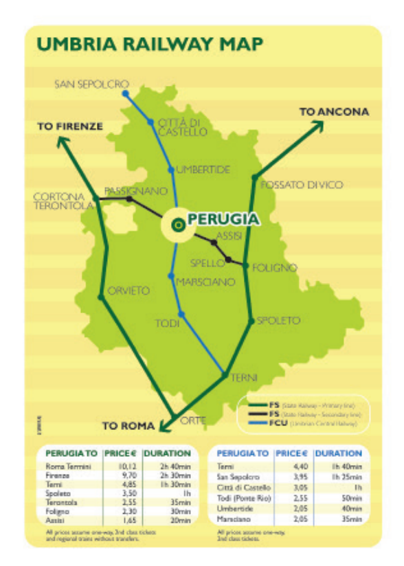
Note that these train prices are not current.

Taxi – Should you want to take a taxi in Perugia, call + 39 075.500.4888. Some addresses of hotels are above. Please quote the "Food Conference" when you make your hotel reservation. The Umbra Institute is located at Piazza IV Novembre, 23.